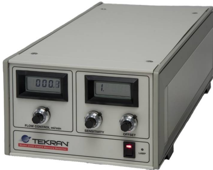
Electronic Flow Adjust Model shown

The Model 2500 is a Cold Vapor Atomic Fluorescence Spectrophotometer (CVAFS) elemental mercury detector. The advantages of atomic fluorescence over more traditional atomic absorption (AA) techniques are well known. They include: very high sensitivity, superior immunity to false positive responses, and inherent linearity.